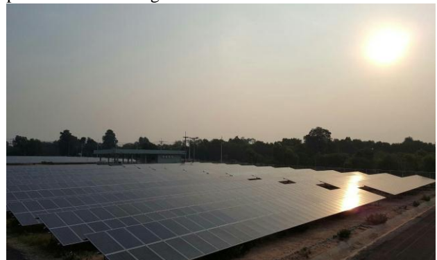
Figure 9. The Smart Solar Farm project

After the 2012-2015 periods, Khon Kaen university has one main solar cells projects, the smart solar farm. The Smart Solar Farm project is funded by the Energy Policy and Planning office (EPPO), Ministry of Energy, Thailand. (Fig.9) It is a 1 Mw solar farm that can save cost of electricity for the university about 500,000 bath per month. (Fig.10) The other projects are the university hospital solar roof, solar street lighting and other solar lighting in buildings and agriculture farm which are in the process of collecting data.