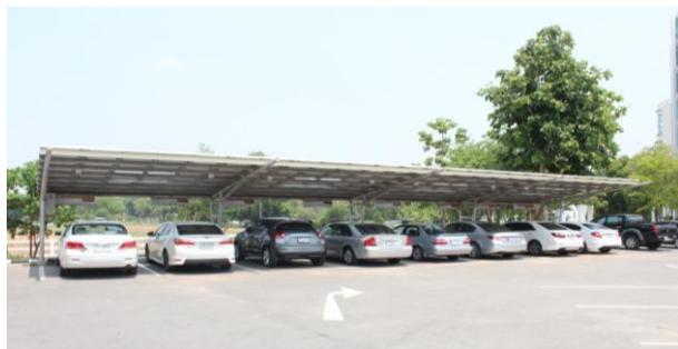
Figure 7. The university boards' parking

This project can produce electricity of 13,068 Kw-Hr/year or 52,272 bath/year.