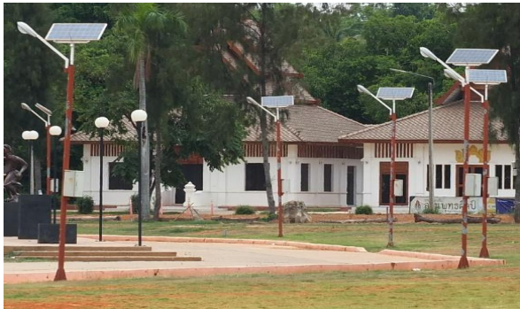
Figure 1. Sithan Park lighting

Crystalline solar cells were connected to the 42 W LED lighting bulb with 100 Ah battery and Solar Charger Controller. The project provides the lighting for part of Sithan Park, the main recreation area in Khon Kaen university. It can produce electricity of 1,814.4 Kw-Hr/year or 7,257.6 bath/year.