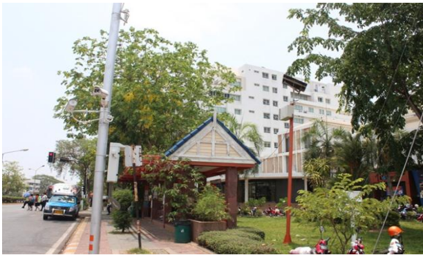
Figure 6. The main library bus stop lighting