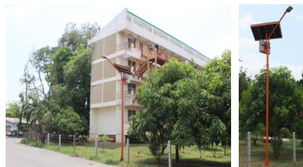
Figure 4. The 22nd dormitory lighting

The street light next to a student dormitory is the E-KKU-2 version. (Fig.4) This version used the 5 m. height steel column with 42 Watt LED light bulb, 120 watt solar cell panel and 100 Ah battery. The solar cells panel can adjust 38 degree vertically and 250 degree horizontally. The project provides the lighting for parking area in front of the president office. It can produce electricity of 544.3 Kw-Hr/year or 2,177.3 bath/year.