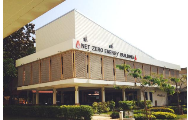
Figure 8. The university boards' parking

The 78 PV panels installed on the roof can produce electricity of 22,944 Kw-Hr/year or 91,776 bath/year.