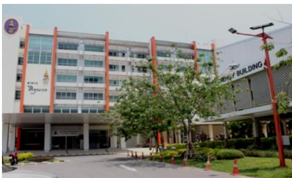
Figure 2. The president office's parking lighting

The 5 street lighting poles, E-KKU-3 version, are designed for the parking area in front of the president office building, Sirikunakorn building. (Fig. 2) For this version, the square section steel column was used to support the LED light bulb. The design of the pole is different from the first version as 6 x 6 inches used for the bottom of the pole and 4 x 4 inches for the top portion of the pole. The 42 watt LED light bulb connects to the pole by 2 x 2 inches steel that can adjust 90 degree vertically. The 100 Ah 12 Volt battery is designed to located on the middle high of the pole. The project provides the lighting for parking area in front of the president office. It can produce electricity of 1,088.6 Kw-Hr/year or 4,354.6 bath/year.