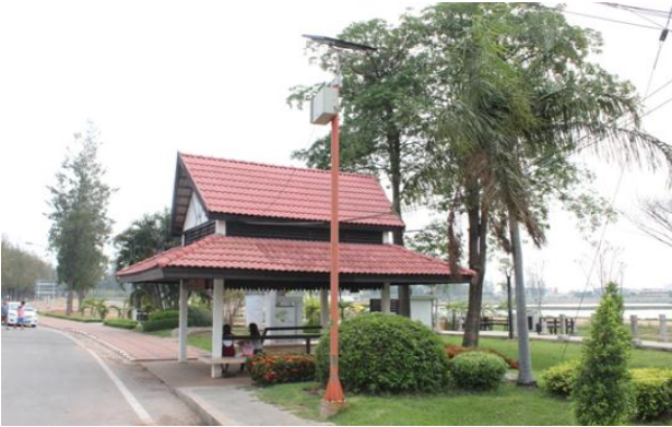
Figure 5. The Srithan bus stop lighting