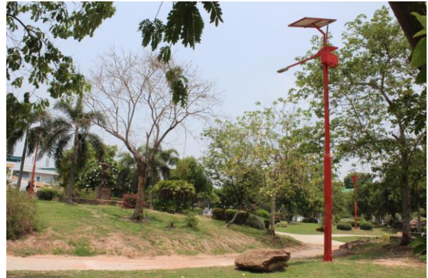
Figure 3. The Rukhachat Park lighting

The E-KKU-3 version applied for another university park, Rukhachat Park, located on the central of the KHon Kaen University campus. (Fig.3) The five sets of this version were installed mainly for the pathway of the park. The project provides the lighting for parking area in front of the president office. It can produce electricity of 1,080.0 Kw-Hr/year or 4,320.0 bath/year.