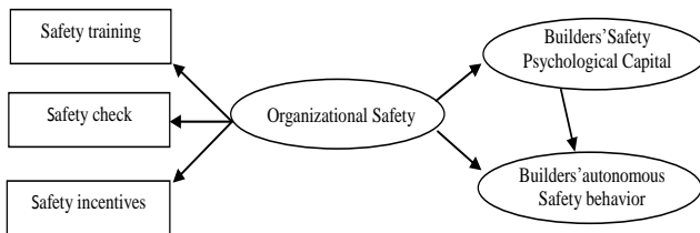
Figure 1. The relationship model of organizational safety behavior, builders' safety psychological capital and autonomous safety behavior

Based on the above theoretical analysis, a conceptual model of the relationship among organizational safety behavior, builders' psychological capital and builders' autonomous safety behavior is proposed as shown in Fig1.