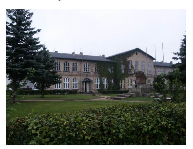
Figure 1. Front elevation of the analysed building.

The post-factory building constructed in 1892, located in the north-east part of Poland was analysed (Fig. 1). In 20th century it was changed to a school, a community centre to be used by about 130 people, 9 flats and public offices. Total heated area was estimated as 2100 \text{ m}^2 , while the building's volume was 8776 \text{ m}^3 .