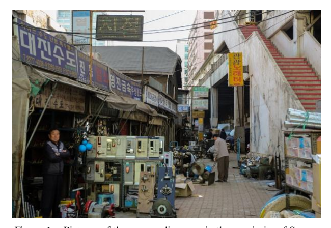
Figure 6. Pictures of the surrounding area in the proximity of Sewoon Sangga (on the right)