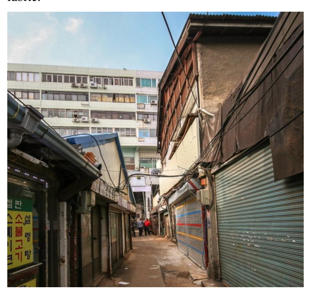
Figure 5. Picture of the surrounding area in the proximity of Sewoon Sangga (in the background).

The result was instead a very rigid composition of volumes that paradoxically were able to be transformed and reinterpreted throughout the years. The everchanging surrounding area, with its medley composition of the urban program, has instead conquered the Sewoon Sangga, imposing its program and creating a productive system in the very heart of Seoul, Fig. 5 and 6. This ecosystem is now studied by many urban planners, sociologist and policy-makers. Although this area is still under threat by the existing urban code and guidelines, which allows for 600% of floor area ration, with no clear definition of detailed guidelines for the big blocks [15]. This uncertainty is allowing the transformation of large sections of the area, imposing large blocks and tall buildings, creating a further clash with the existing urban fabric.