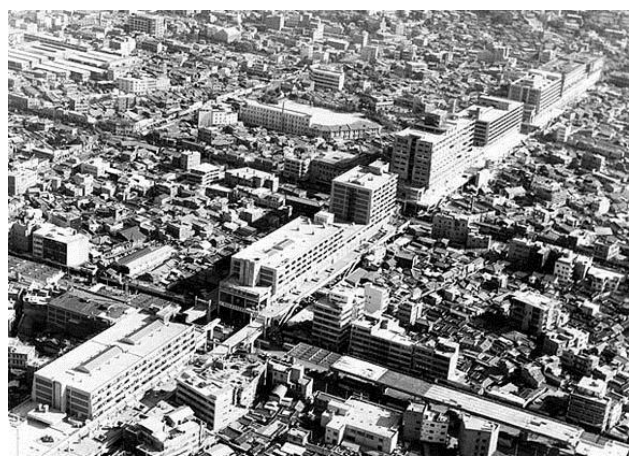
Figure 3. Sewoon Sangga, Seoul, 1968.

Sewoon Sangga is the most famous megastructure project constructed in Seoul which embodies all of the main characters of the modernist utopia. It spans from Jongmyo, in the north, to Namsan in the south, and is composed of four blocks interconnected by an elevated pedestrian deck level on the third floor. This constitutes the actual artificial land, forming a one-kilometre-long building. The complex initially contained commercial facilities up to the fourth floor and residential units on the upper stories. Sewoon Sangga was acclaimed for its innovative hybrid composition of functions, although it lost its fame shortly afterwards, in favour of the newly constructed neighbourhoods on the southern side of the Han River that flourished from the 1970s.